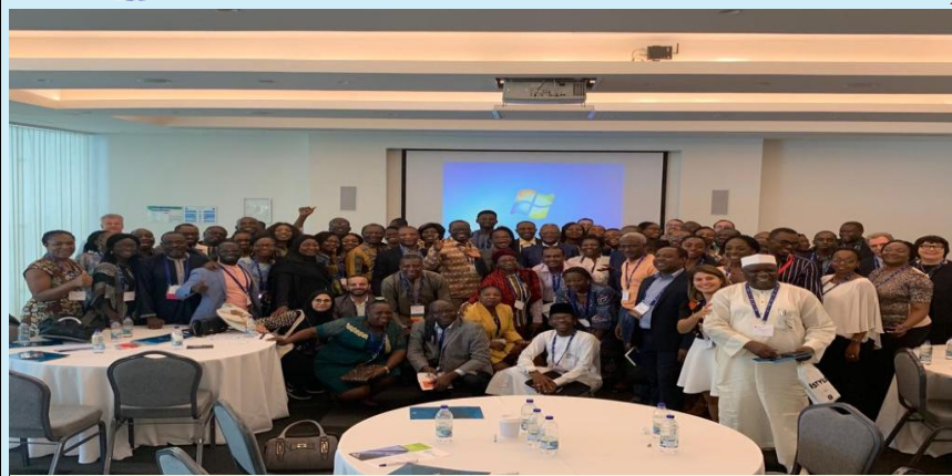
Group picture at APF AGM, Abu Dhabi 2019