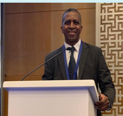
APF Secretary General